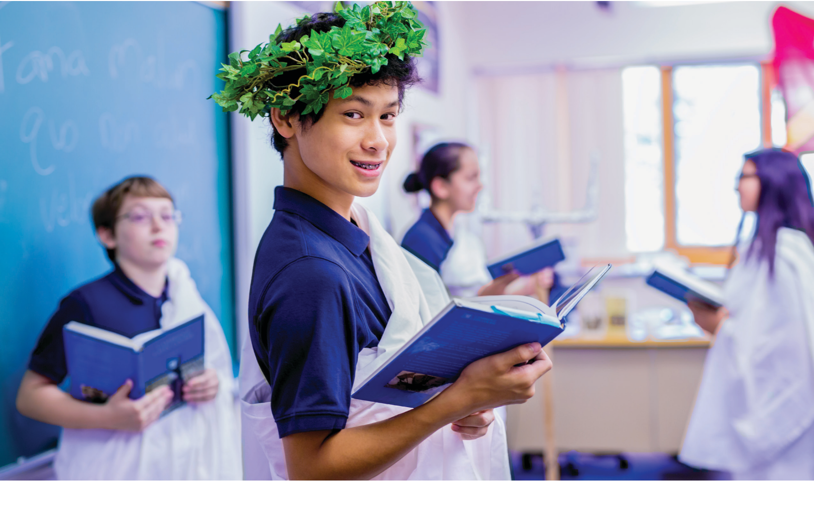
Wyndcroft School: "Non Sibi," "Not for oneself, but for the good of others"

Students at The Wyndcroft School receive a firm educational foundation, learn in the spirit of Non-Sibi, become a part of a true community, and develop leadership skills that translate to success in secondary school and beyond.